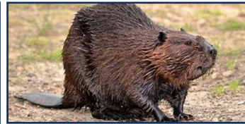
North American Beaver ( Castor canadensis )