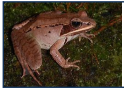
Wood Frog ( Rana sylvatica )

Let us respectfully acknowledge and learn from this significant history, while also appreciating the current beauty that exists here and recognizing the social, health, and other benefits we now derive from these unceded ancestral lands of indigenous people.