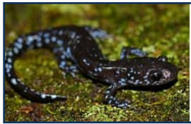
Spotted Salamander ( Ambystoma laterale )