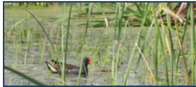
Common moorhen ( Gallinula chloropus )