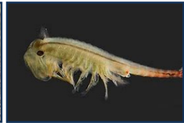
Fairy Shrimp ( Eubranchipus spp.)

At the Riverfront Woods Preserve, there are rich scrub-shrub wetlands, thriving seasonal vernal pools, hard and softwood forests, and the Royal River ecosystem. Here, these natural resources are uniquely available to all ages and abilities with new, universally accessible trails underway.